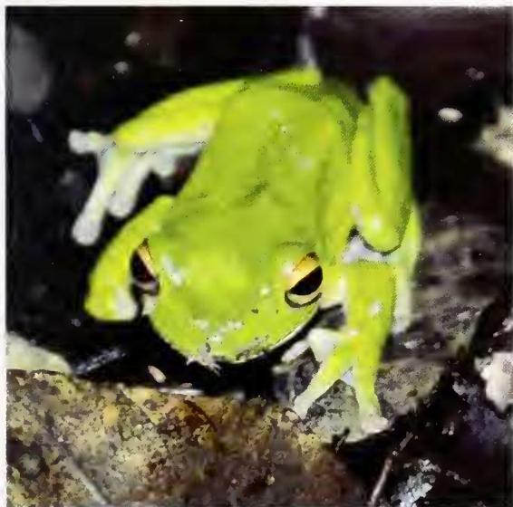
Fig. 5. Litoria infrafrenata from Salibabu Island.

Additional material: MCZ A-24288, Karakelong, coll. FAIRCHILD Garden Expedition 1940; ZMA 8570 (3 spec.), Lirung, Salibabu, coll. M. WEBER 1899; ZMA 8576 (1 spec.), Beo, Karakelong, coll. M. WEBER 1899.